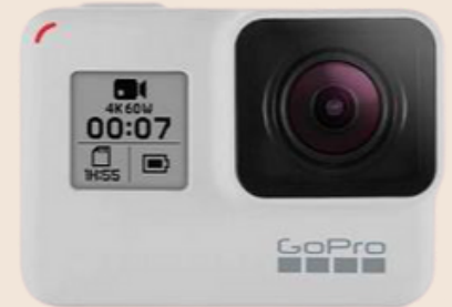
GPRO HERO 7 WHITE