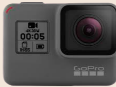
GPRO HERO 5 BLACK

GoPro is a big name engaged in manufacturing action cameras and developing apps and video editing softwares. It mainly focuses on action cameras and came out with Hero range of cameras. They are among the best, which are being used by everyone from skilled professionals to amateurs. In its Hero series, Go Pro has come up with 15 variants. In this article we are comparing two of its most popular and widely purchased action cameras- GoPro Hero 5 black and GoPro Hero 7 white